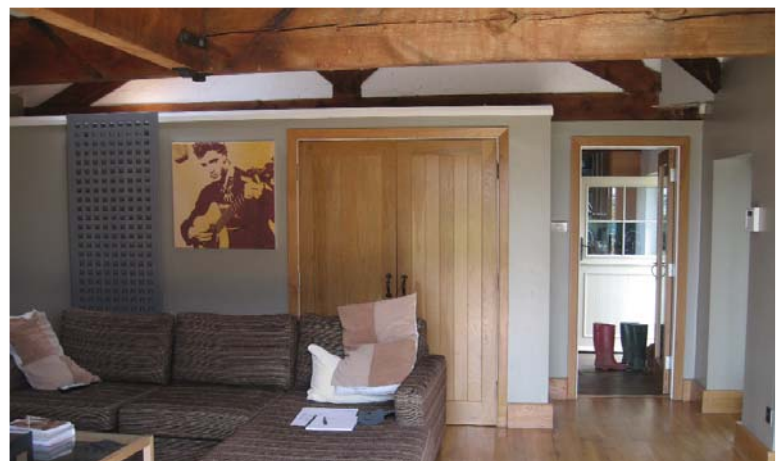
Domestic retro-fit (before)