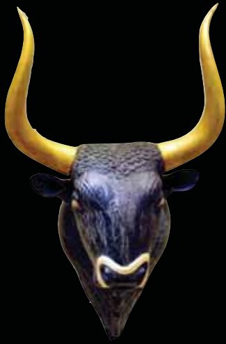
Crete / 17 th century BC