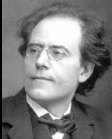
Theodor W. Adorno / Gustav Mahler