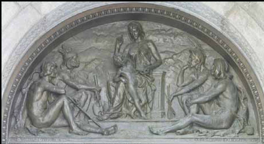
Tradition (1895) / Tympanum