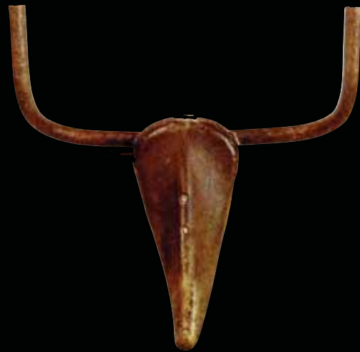
Picasso / 1942 AD