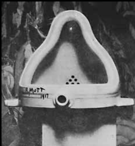
Marcel Duchamp / 1917