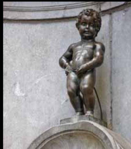
Hieronimus Duquesnoy / 1619