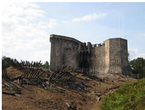
Mock castle at the Bourne Wood at the end of filming of the film Robin Hood , showing the burnt-out castle gate

https://en.wikipedia.org/wiki/Bourne_Wood